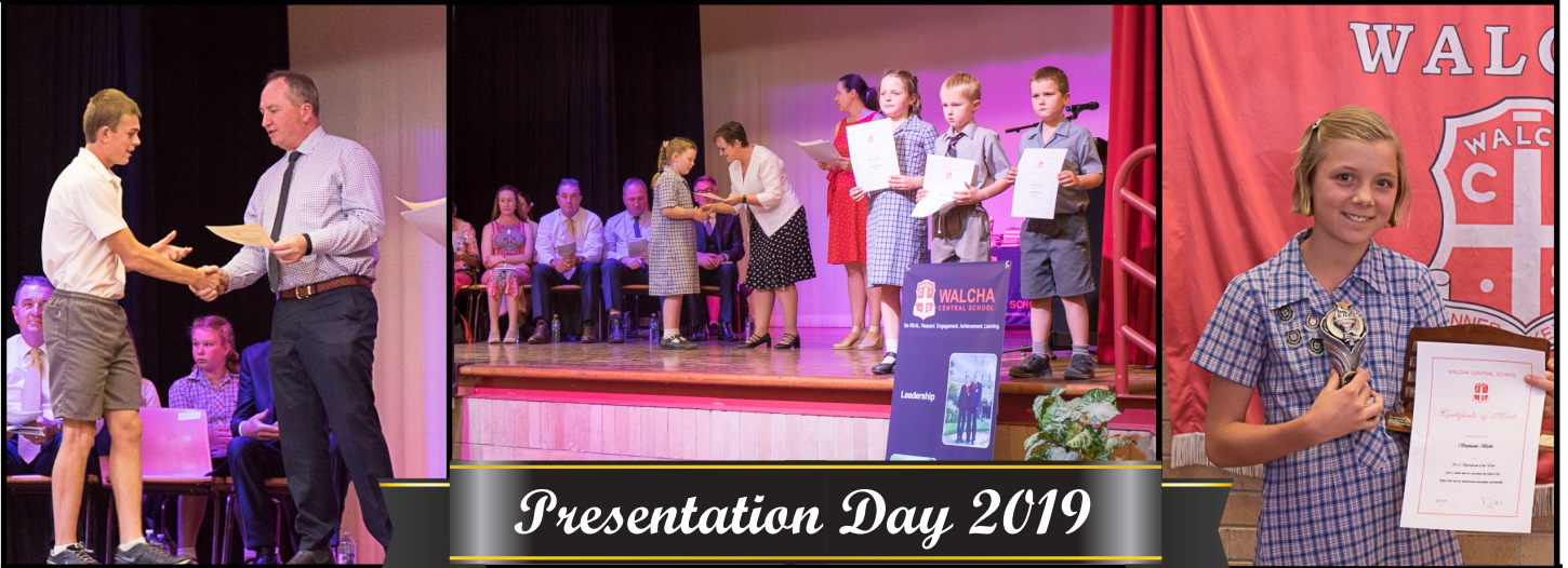
Presentation Day 2019

NEWS AND VIEWS OF YOUR LOCAL CENTRAL SCHOOL